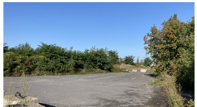
Southeast corner of the property looking northwest.