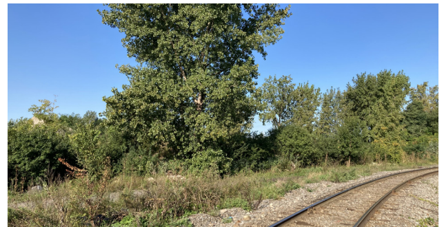
Southeast corner of the property looking northwest.