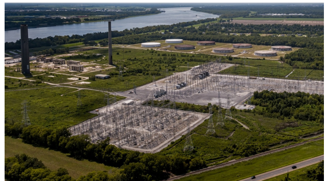
Entergy Substation providing up to 450 MW

Bulk liquids, energy, production, warehousing, etc.