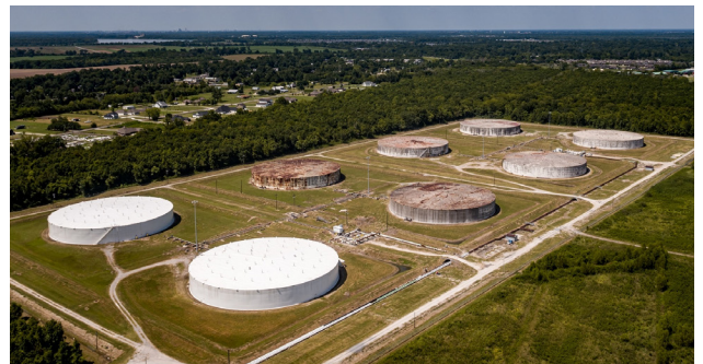
2.26-million-barrel tank farm capacity