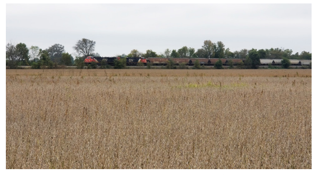
View from property looking southeast (CN train)

Ideal, but not limited to: agricultural, automotive, renewables and steel manufacturing