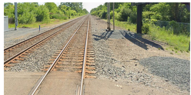
CN mainline from Genesee Rd