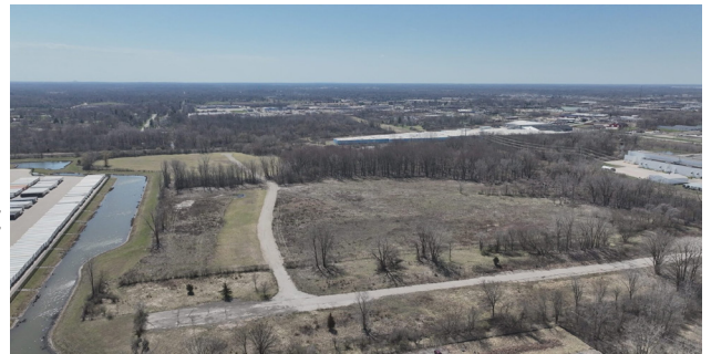
Drone image from Davison

Industrial manufacturing, logistics, rail-served industry, automotive and advanced manufacturing supply chain