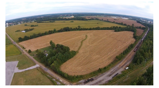
Looking Southeast across the site

Highways: Future Interstate 69 (less than 0.5 mi.)