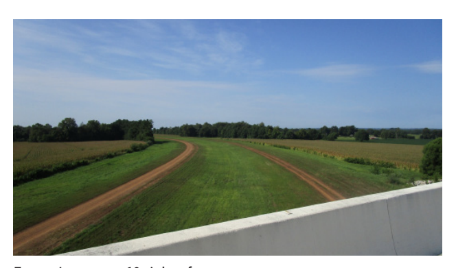
Future Interstate 69 right-of-way