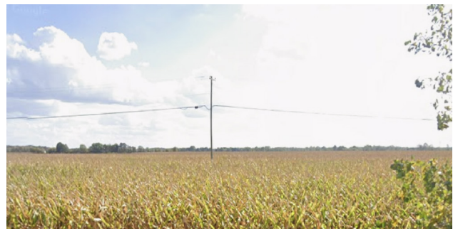
Looking south from Maple Ave.

Suitable for manufacturing, warehousing, production and more