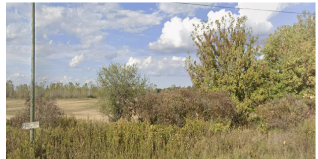
Looking north from Maple Ave.