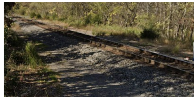
CN mainline from Elms Rd.