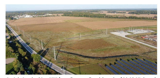
Aerial view looking NW from Decatur Road (south of M-60 Highway)