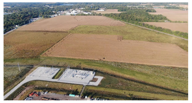
Aerial view looking WSW from Decatur Road – substation in foreground; M-60 Highway on left; CN Rail on right