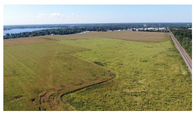
Aerial view looking SW towards Cassopolis - Diamond Lake on left and CN Rail on right

Ideal, but not limited to agricultural, automotive, and metals manufacturing