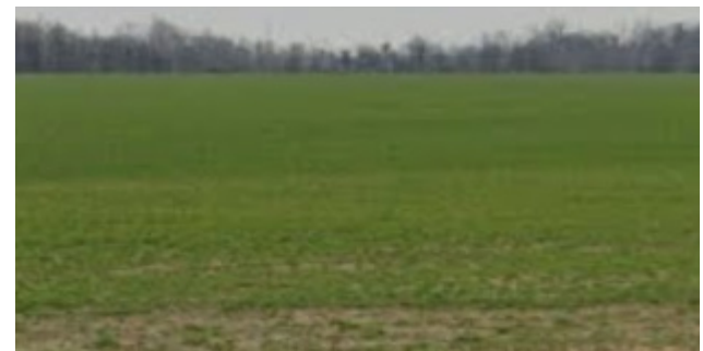
View from Starlanding Rd