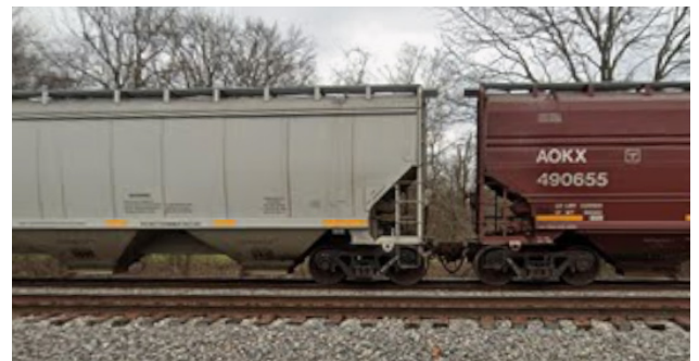
View of CN mainline adjacent to site