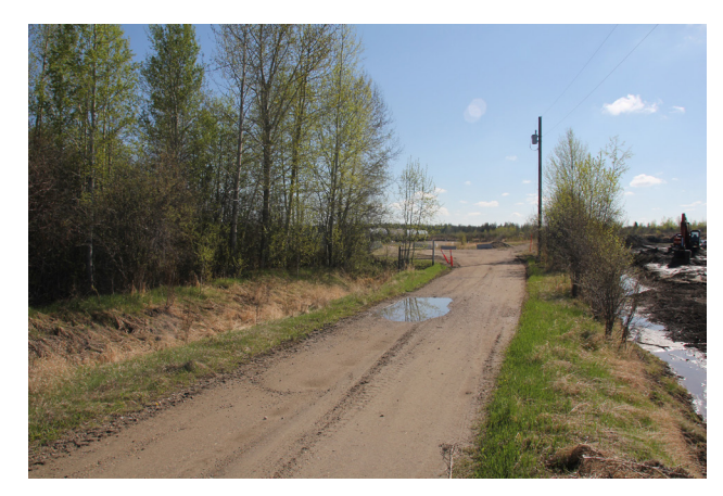
Southwest corner access road