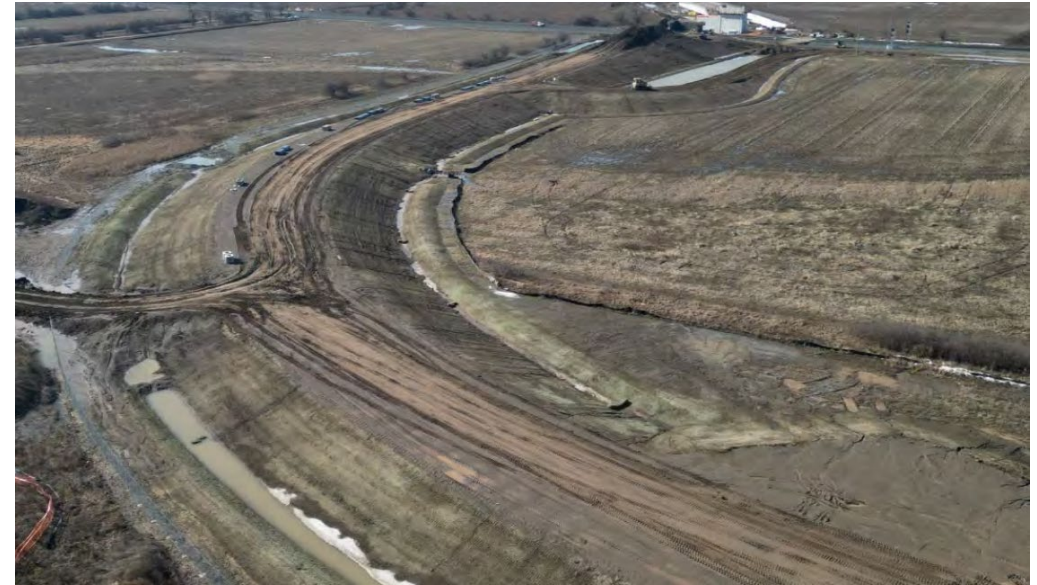
Figure 8 – March 18, 2025

Grading and shaping of the truck access road east of the mainline, viewed westward from the work zone.