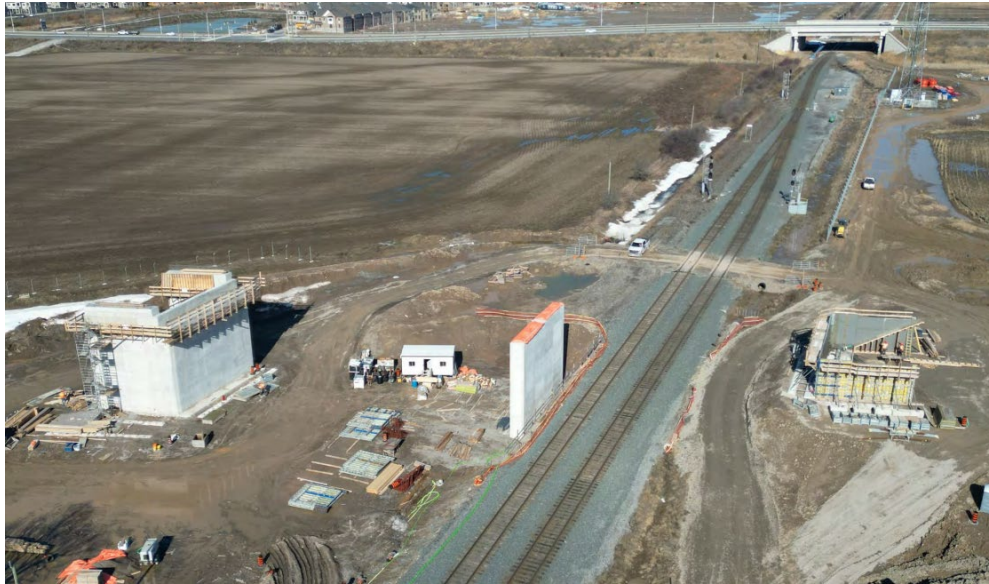
Figure 7 – March 18, 2025

Work advances on the eastern bridge abutment for the Britannia Access Road.