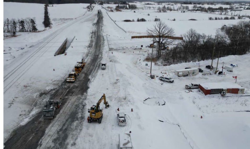
Figure 6 – February 18, 2025

Track installation and alignment continue despite snow.