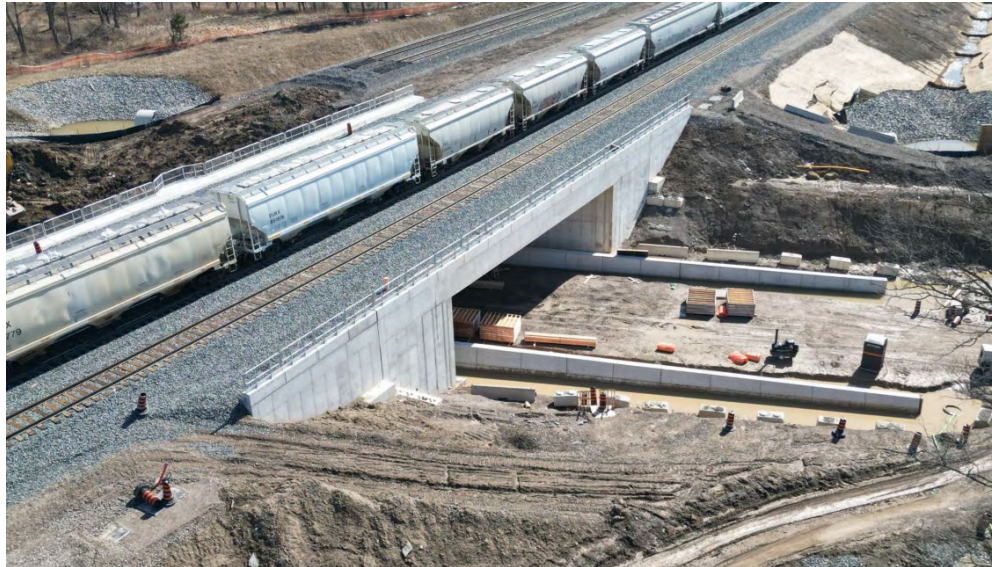
Figure 3 – March 18, 2025

Active CN mainline now spans the Lower Base Line grade separation as excavation continues beneath the overpass.