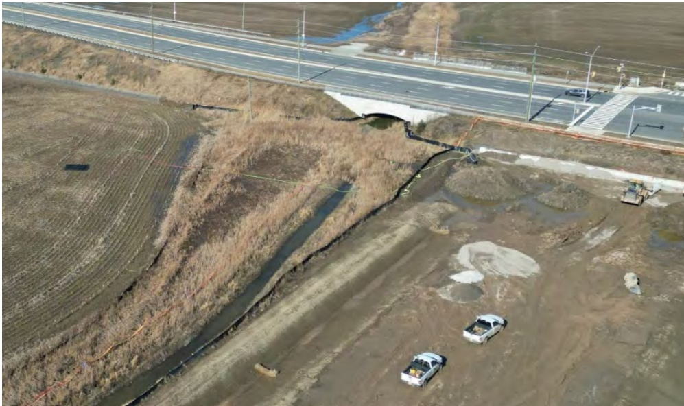
Figure 9 – March 18, 2025

Shaping of the future road connection to Britannia Road, adjacent to Tributary A, as part of truck route finalization.