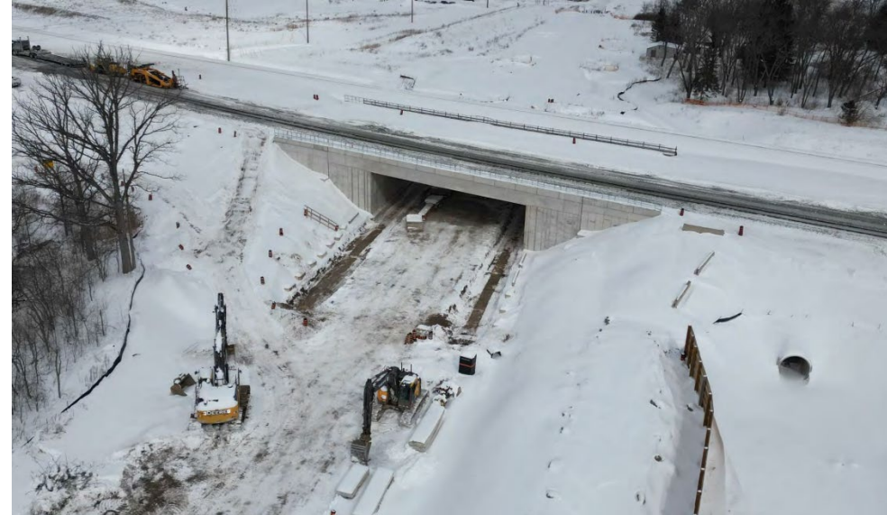
Figure 4 – February 18, 2025

Despite winter conditions, underpass construction continues on schedule at Lower Base Line.