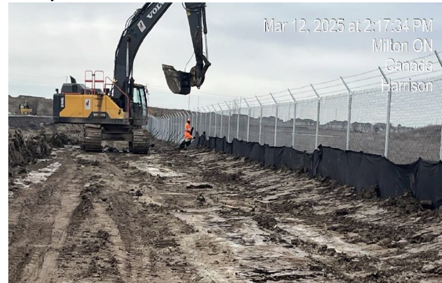
Figure 10 – March 12, 2025

Ongoing chain link fence installation north of Britannia Road, part of site security measures.