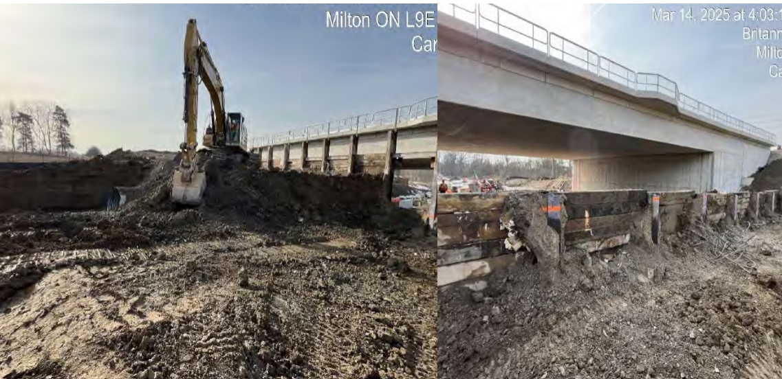
Figure 2 – March 14, 2025

Excavation of material and removal of lagging timbers and H piles from the shoring wall east of the mainline at Lower Base Line.