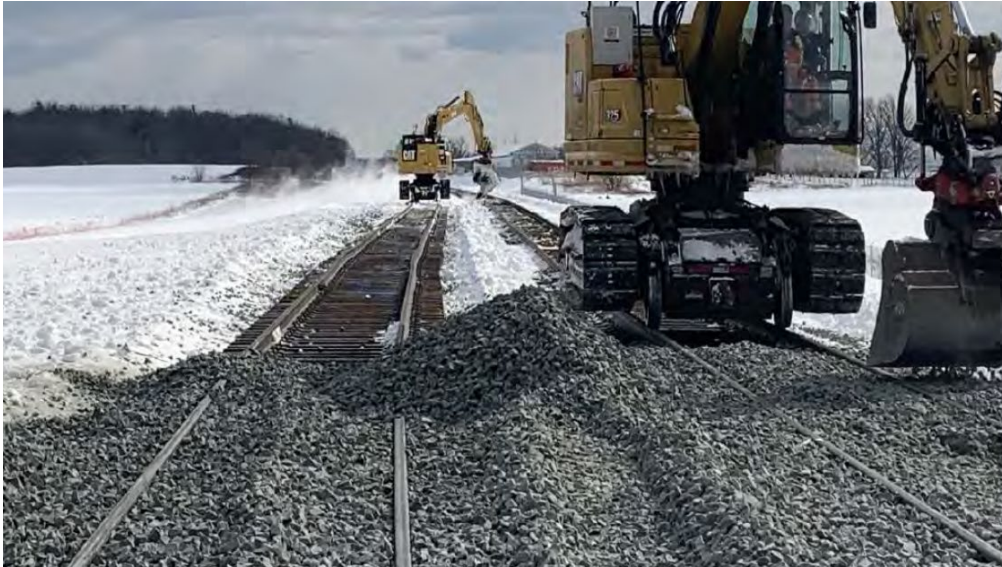
Figure 5 – February 14, 2025

Addition and spreading of ballast along the new mainline tracks south of Lower Base Line during track realignment works.