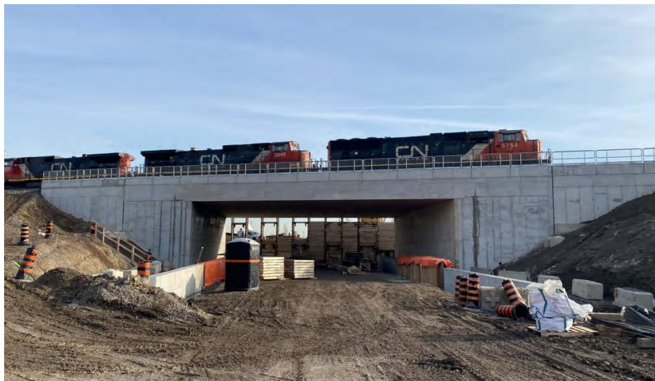
Figure 1 – March 14, 2025

Daylight becomes visible as the shoring wall on the east side of the Lower Base Line underpass is removed, signalling major excavation progress.