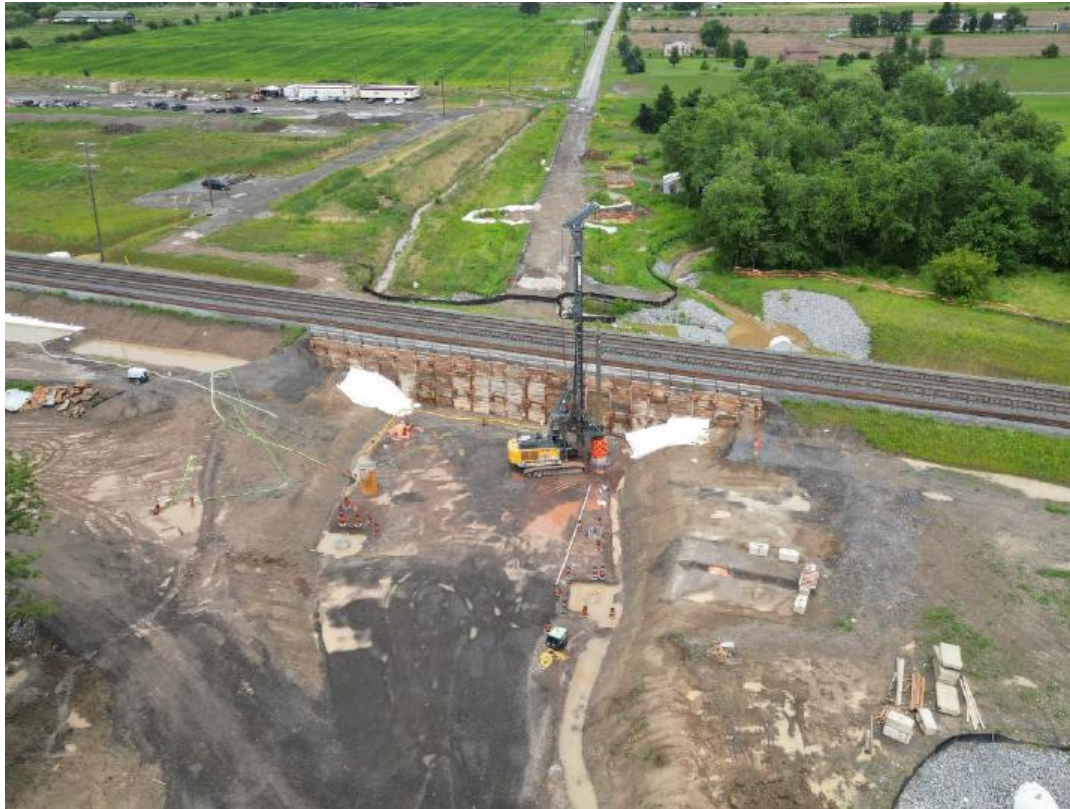
Figure 1 – July 15, 2024