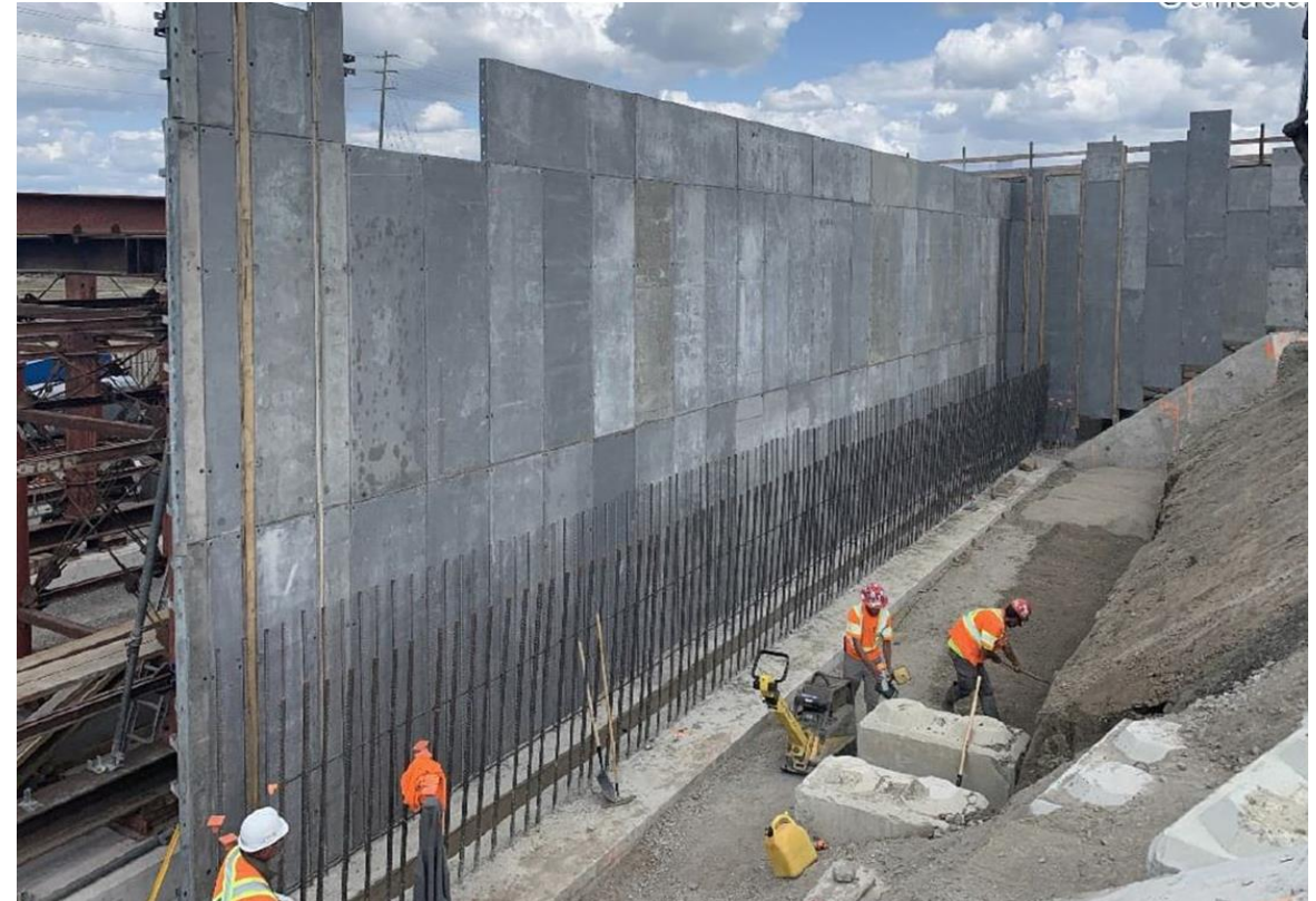
Figure 2 – August 22, 2024