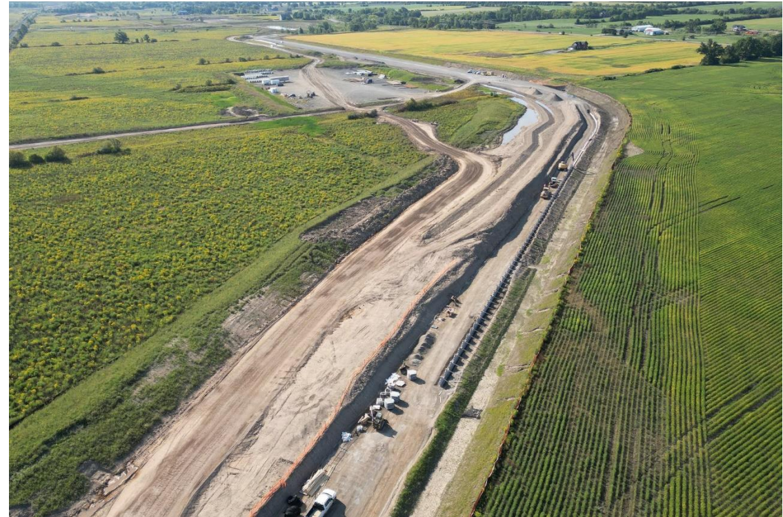
Figure 4 – September 27, 2024

Reinforced Soil Slope Wall Installation Progress