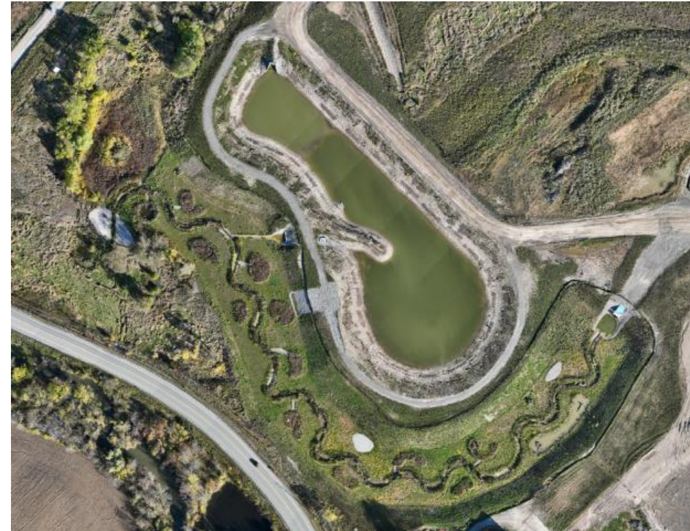
Figure 6 – October 2024

Vegetation growth progress on the riparian wetlands surrounding the realigned section of the Tributary A channel and the stormwater pond