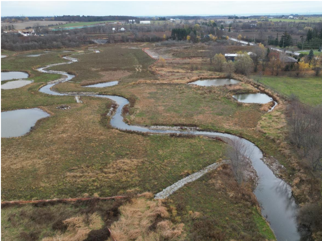
Figure 5 – October 2024

Vegetation growth progress on the riparian wetlands surrounding the realigned section of Indian Creek