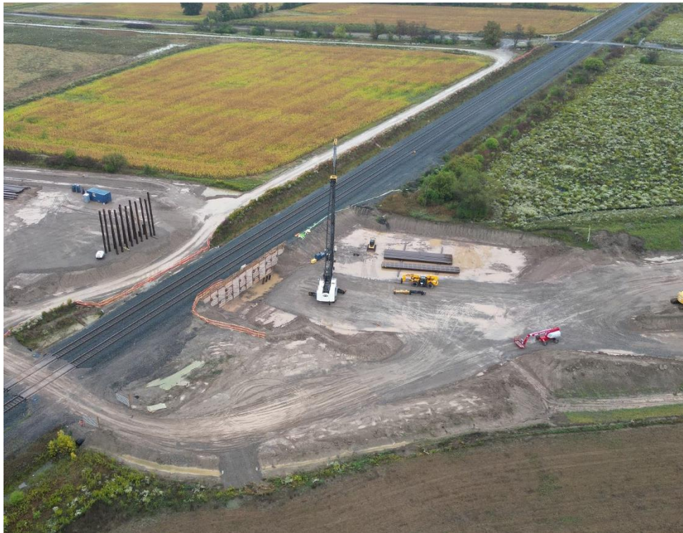
Figure 3 – September 16, 2024

Britannia Access Road Overpass Shoring Wall and Bridge Progress