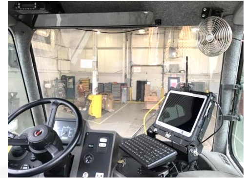
Shunt truck interior with vehiclemounted computer.