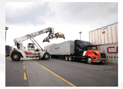
Reach stacker serving a CNTL owner operator.

Real-time bird's eye view of cranes, shunt trucks, and containers..