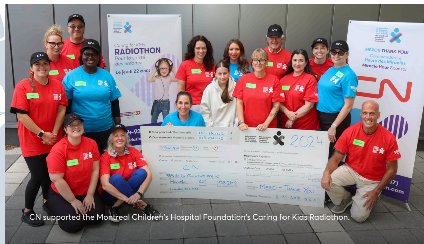
CN supported the Montreal Children's Hospital Foundation's Caring for Kids Radiothon.

Over the past decade, CN has invested about $4.5 billion to build and maintain a safe and efficient network in Quebec and to support our supply chain partners. Expansion projects included the development of several major I&T projects. Maintenance projects focused on the replacement of rail and ties, plus upkeep of crossings, bridges, culverts, signals, and other track infrastructure.