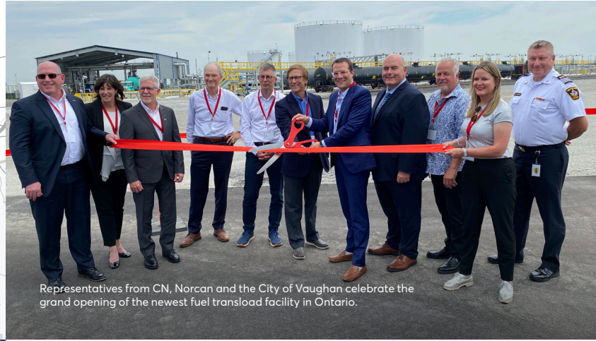
Representatives from CN, Norcan and the City of Vaughan celebrate the grand opening of the newest fuel transload facility in Ontario.

Over the past decade, CN has invested more than $4.0 billion to build and maintain a safe and efficient network in Ontario and to support our supply chain partners. Expansion projects included the transformation of our intermodal operations. Maintenance projects focused on the replacement of rail and ties, plus upkeep of crossings, bridges, culverts, signals, and other track infrastructure.