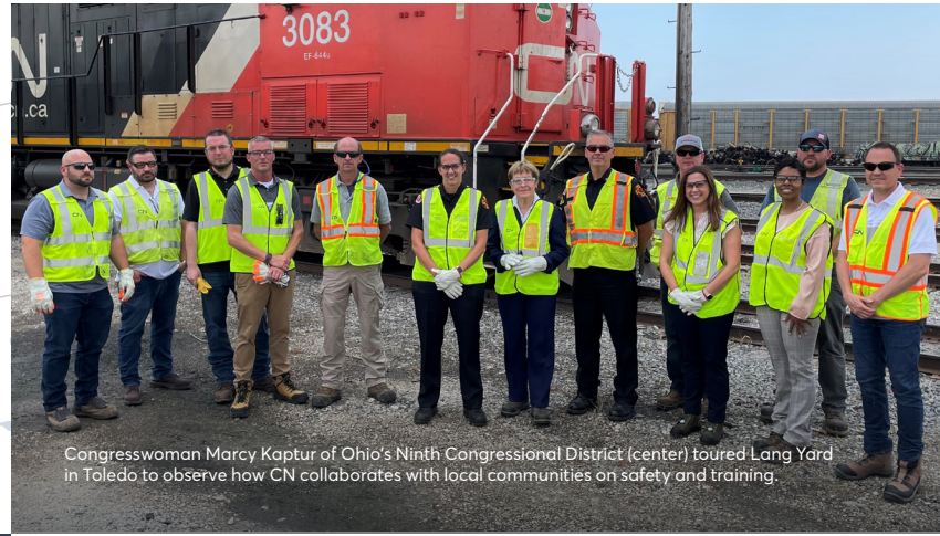
Congresswoman Marcy Kaptur of Ohio's Ninth Congressional District (center) toured Lang Yard in Toledo to observe how CN collaborates with local communities on safety and training.

Over the past decade, CN has invested about US$40 million to build and maintain a safe and efficient network in Ohio and to support our supply chain partners. The program focused on maintenance of Great Lakes Fleet vessels, the replacement of rail and ties, plus maintenance of bridges, crossings, culverts, signal systems, and other track infrastructure.