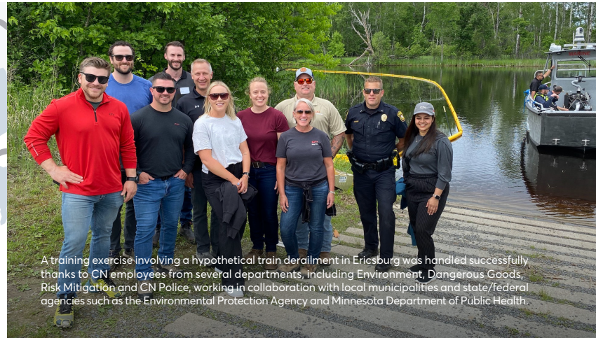
A training exercise involving a hypothetical train derailment in Ericsburg was handled successfully thanks to CN employees from several departments, including Environment, Dangerous Goods, Risk Mitigation and CN Police, working in collaboration with local municipalities and state/federal agencies such as the Environmental Protection Agency and Minnesota Department of Public Health.

Over the past decade, CN has invested about US$830 million to build and maintain a safe and efficient network in Minnesota and to support our supply chain partners. The program focused on network upgrades, the replacement of rail and ties, plus maintenance of Great Lakes Fleet docks, bridges, crossings, culverts, signal systems, and other track infrastructure.