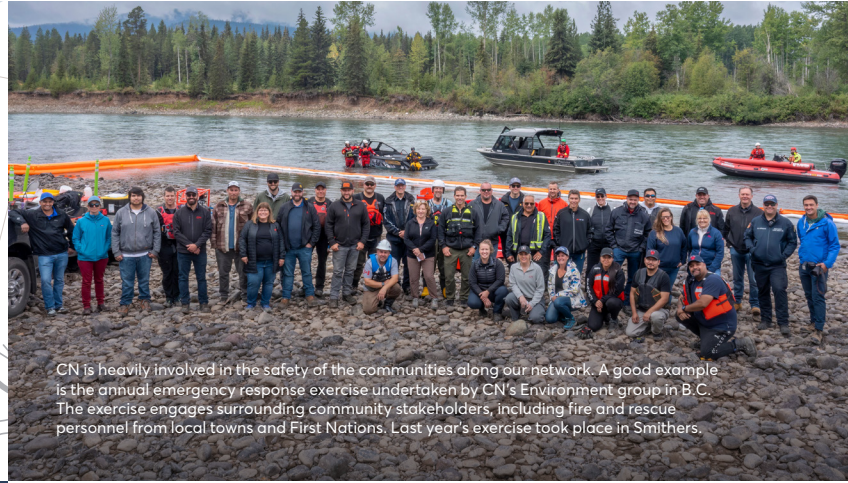
CN is heavily involved in the safety of the communities along our network. A good example is the annual emergency response exercise undertaken by CN's Environment group in B.C. The exercise engages surrounding community stakeholders, including fire and rescue personnel from local towns and First Nations. Last year's exercise took place in Smithers.

Over the past decade, CN has invested more than $4.5 billion to build and maintain a safe and efficient network in B.C. and to support our supply chain partners. Expansion projects included the construction of new and extended sidings as well as double-tracking sections of our main lines to the ports of Prince Rupert and Vancouver. We have also undertaken a multi-year track rehabilitation program to support growing business in northeastern B.C. Maintenance projects focused on the replacement of rail and ties, plus upkeep of crossings, bridges, culverts, signals, and other track infrastructure.