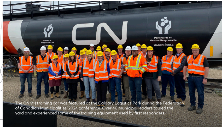
The CN 911 training car was featured at the Calgary Logistics Park during the Federation of Canadian Municipalities' 2024 conference. Over 40 municipal leaders toured the yard and experienced some of the training equipment used by first responders.

We continue to make significant investments in our corridors between Edmonton and West Coast ports to support growth in propane, chemicals and refined petroleum products. The Government of Alberta's incentive programs are encouraging the development of new petrochemical facilities in the province. Examples with direct access to CN's network include Imperial Oil, which is building Canada's largest renewable diesel facility (20,000 barrels per day -bpd) at its Strathcona refinery. Pembina is constructing a new propane fractionator at its Redwater Complex, which will increase capacity to 256,000 bpd.