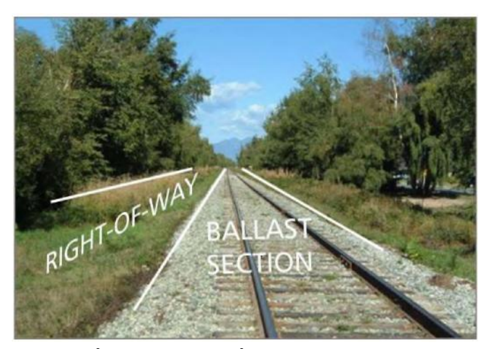
Figure 1: Vegetation Management Zones

As shown in Figure 1, the railway RoW is divided into two vegetation management zones: the ballast and the RoW.