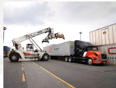
Reach stacker serving a CNTL owner operator.

Real-time bird's eye view of cranes, shunt trucks, and containers..