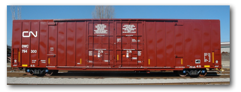
PLUG DOORS MUST BE CLOSED AND LOCKED BEFORE MOVING CAR.

NEVER use a forklift, or similar machine, to apply direct pressure to open or close a boxcar door. This force damages the door and tracks and can result in the door falling out of its track.