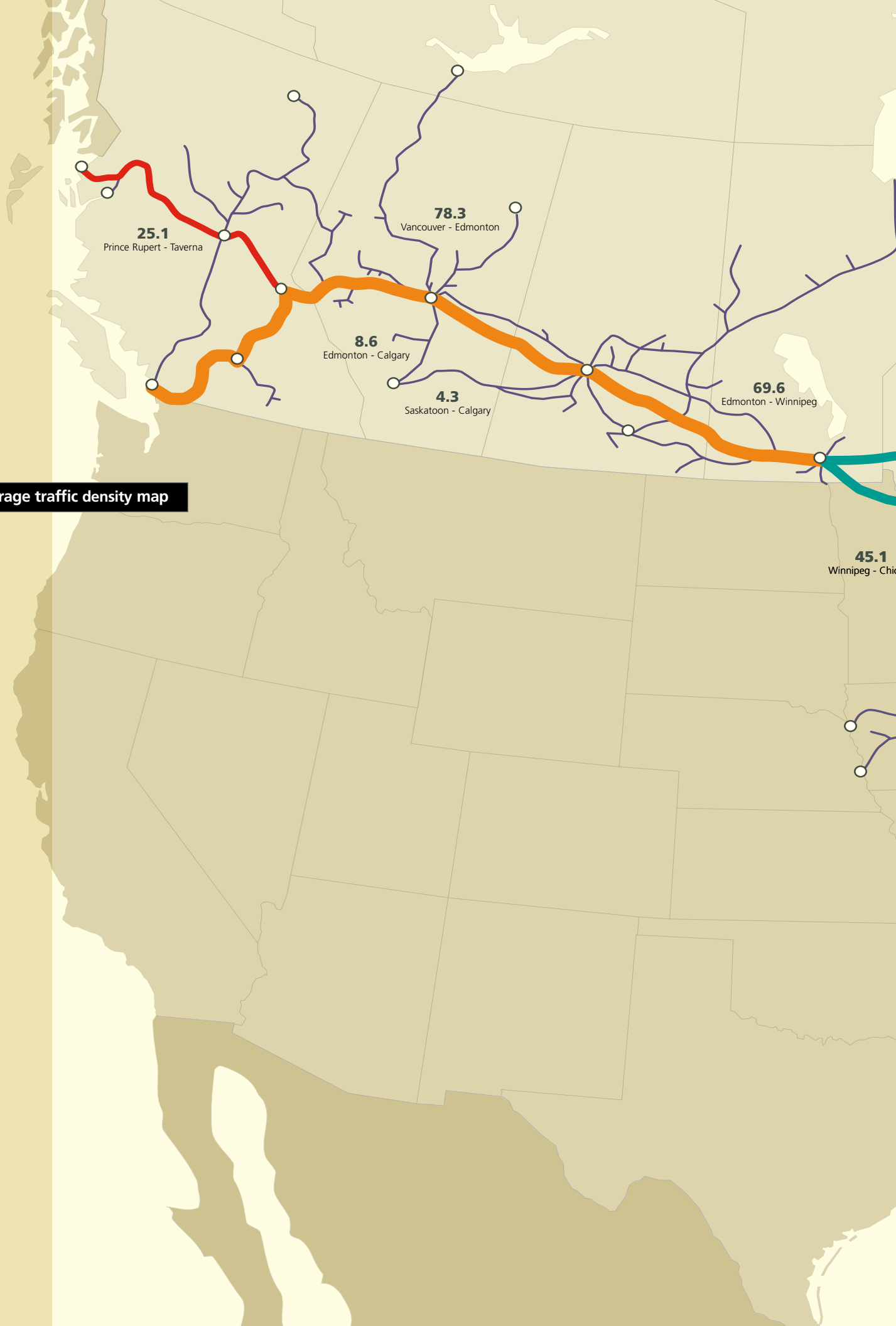
CN average traffic density map