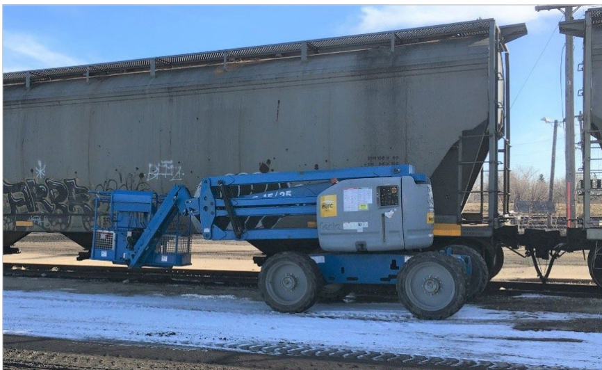
Figure 2. Fall protection - articulated boom ladder