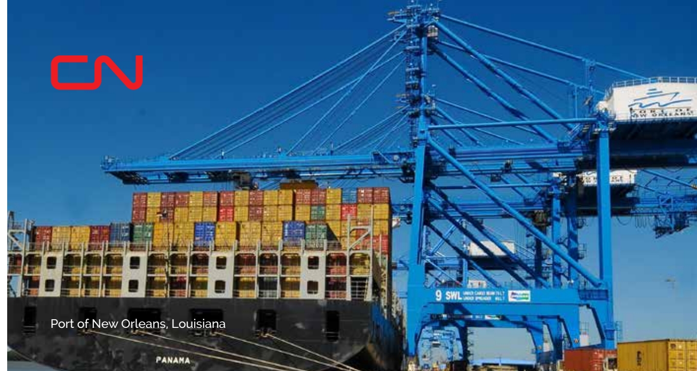
Port of New Orleans, Louisiana