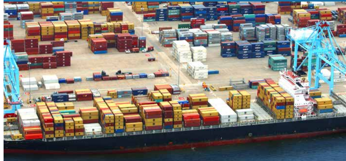
Port of Mobile, Alabama

CN's direct connection offers supply chain options for international trade.