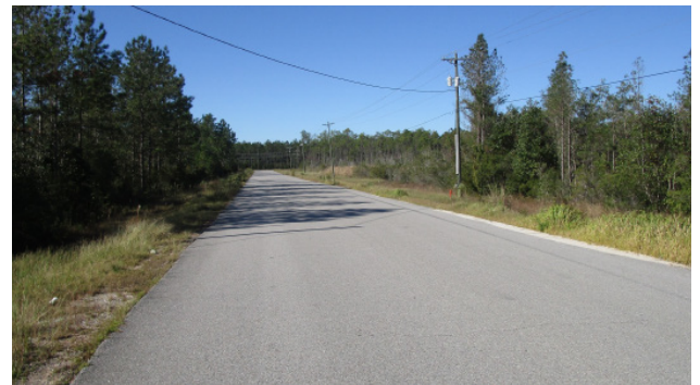
Existing access road serving the industrial complex