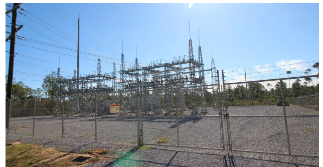
Singing River Electric's substation located in the industrial complex