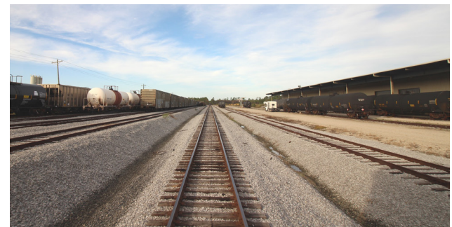
Mississippi Export Railroad's railyard adjacent to the site

Warehousing, production and assembly plants