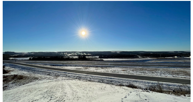
View looking across the highway to the site.