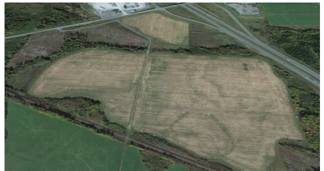
Aerial view of site looking north with Trans Canada Highway on the right and CN rail line at bottom.

Ideal for rail-centric carloads including manufacturing, wood and paper products, transloading