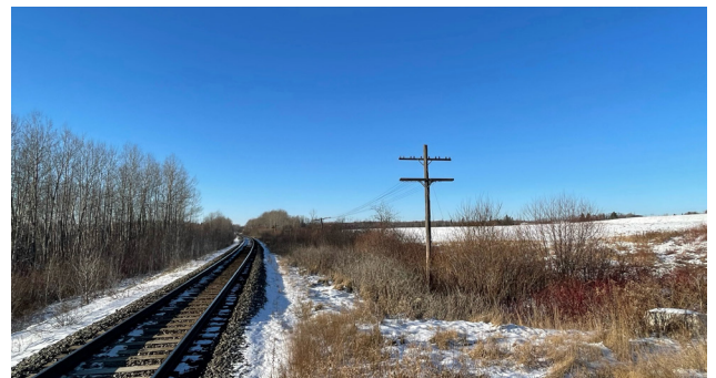
View looking west near CN rail line with site on right.